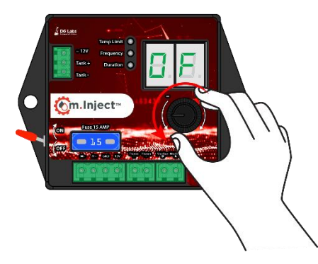
Rotate the knob to the left to change the settings of the current page lower.