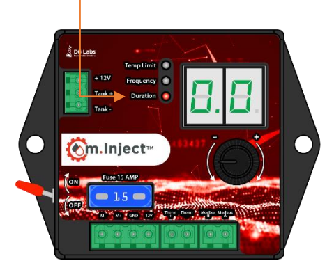
How many minutes the motor stays on every cycle. Values can be set between 0-6 seconds