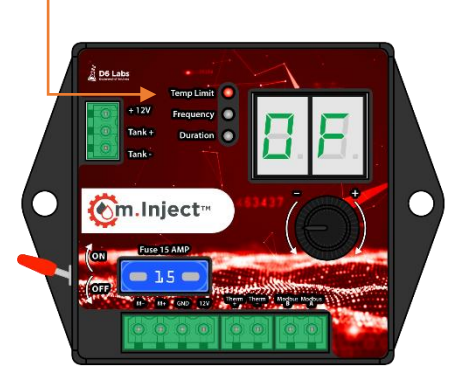
Above 99f = OF (setting is off) If temperature is above limit set motor = OFF